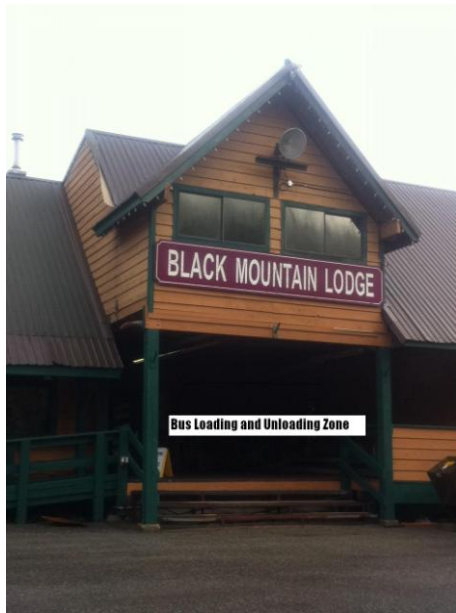
The bus drop off and pick up zone.

You will be greeted by an instructor and escorted up to the 3rd floor.